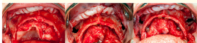
Figure 2: Intraoperative image showing the zygomatic and short implants in position.