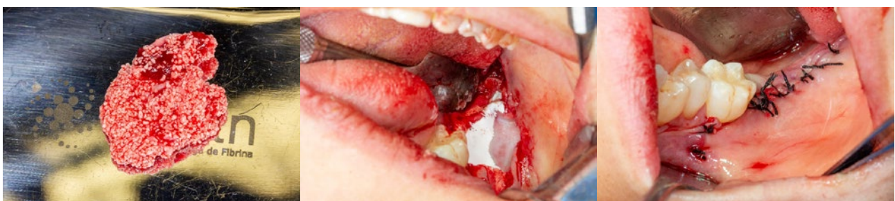
Figure 4. (A) Sticky bone for cyst cavity reconstruction, (B) Osgide® resorbable membrane covering all bone reconstruction, (C) Intraoperative a after suture