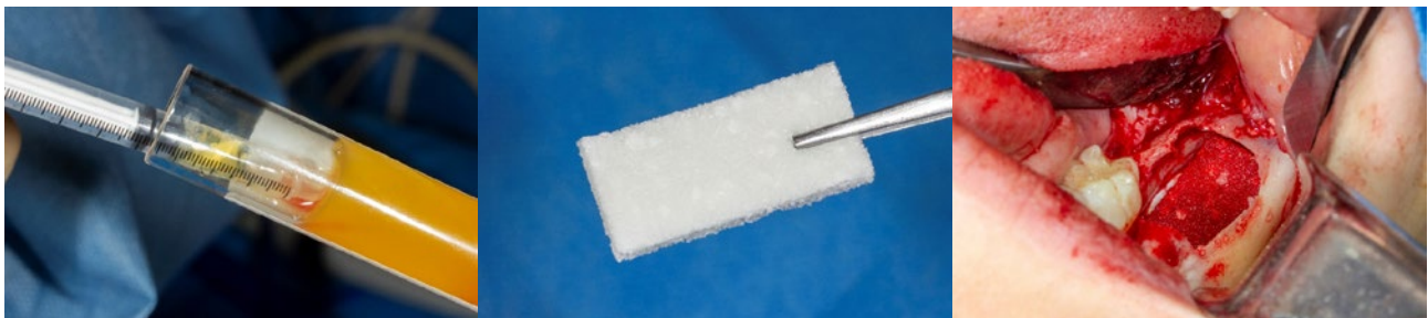
Figure 3. (A) Leukoplakelet fibrin aspect, (B) Cerasorb M® foam used to protect the inferior alveolar nerve, (C) Intraoperative image of inferior layer of bone reconstruction

The patient is in the postoperative period of twelve months, without hypoesthesia or any sign of recurrence of the lesion. In postoperative orthopantomography (Figure 5A) and computed tomography, there is evidence of bone neoformation in the area previously occupied by the lesion (Figure 5B and Figure 5C).