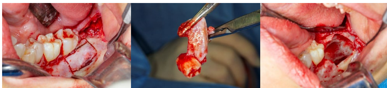
Figure 2. (A) Osteotomy with piezoelectric surgery, (B) Cystic capsule with impacted 3.8, (C) Intraoperative image of the cystic cavity