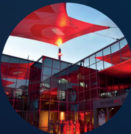
International Museum of the Red Cross