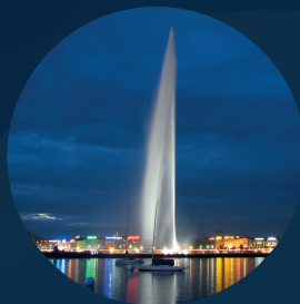
Jet d'Eau fountain