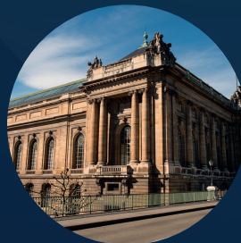
Museum of Art and History