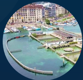
Baths of the Pâquis