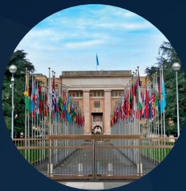
Palace of Nations (UN)

To give you a taste of what this incredible event will be like, I would like to share with you some of the sights of Geneva, Switzerland: